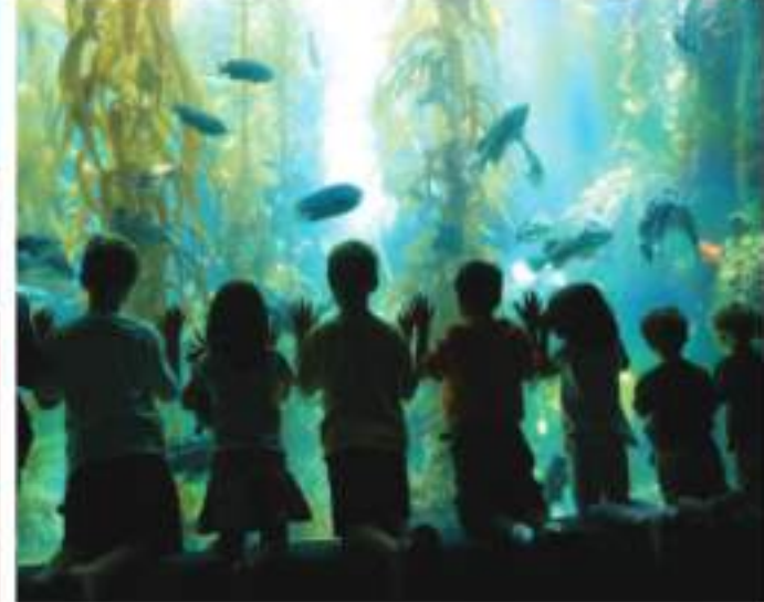
ABOVE: Liberty Public Market. RIGHT: Birch Aquarium at Scripps.

Rocks' seven-story waterfall is the largest manmade waterfall in San Diego, and you can even walk behind it! Should your feet grow weary while exploring, the zoo offers a 35-minute guided bus tour of the park. There's also the Skyfari aerial tram that transports visitors from one end of the park to the other, offering a birds-eye view of the exhibits below.