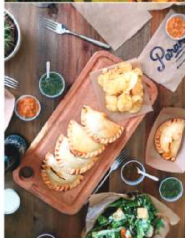
TOP: Balboa Park Plaza. LEFT: San Diego Zoo. ABOVE: Paraná Empanadas Argentinas.

THE SAN DIEGO ZOO is widely acclaimed as the best zoo in America. Encompassing 100 acres and a vast array of animals, many of which are endangered species, the zoo steps into the future with the recent opening of "Africa Rocks." The $68-million project incorporates the latest ideas about exhibits at a time when zoos find themselves in an ongoing debate about the