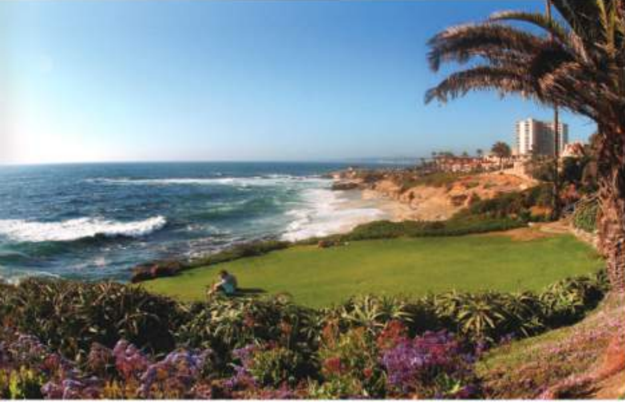
LEFT: La Jolla. BELOW: Cabrillo National Monument. BOTTOM: Old Town Trolley Tour in Little Italy.